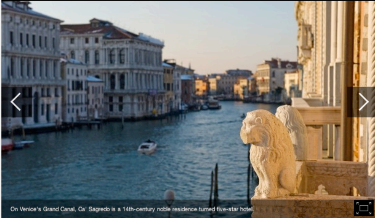
On Venice's Grand Canal, Ca' Sagredo is a 14th-century noble residence turned five-star hotel.